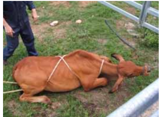
Fig Practical application of Burley's Method (Matthews 2009)

hold the animals head in position, another option to this is the application of a pair of nose grips, which are useful for examination of the dentition of cattle. Other rope options can include the Reuff's or Burley method of casting. These methods are essentially useful if surgery is to be performed on the animal, particularly abdominal surgery where the tying up of the hind leg is essential to control the animal."